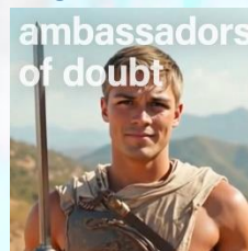
Remembering Ariadne (Jan 2025)

Available on Bandcamp and digital streaming platforms.